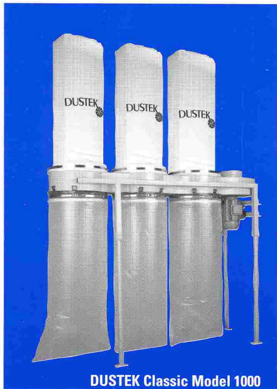
DUSTEK Classic Model 1000