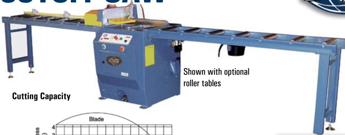
Shown with optional roller tables