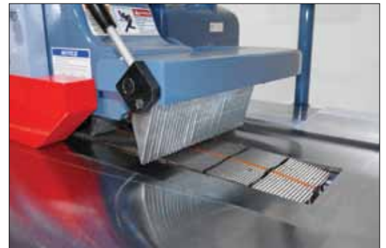
TWO SETS OF anti-kickback fingers ensure operator protection and safety.