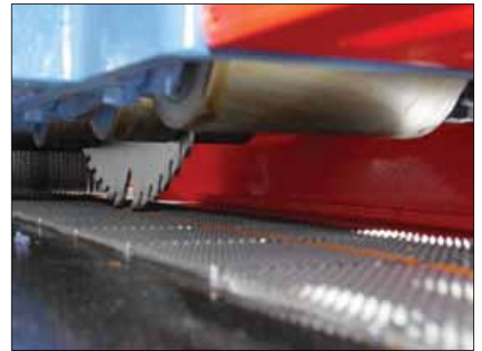
SEVEN PRESSURE ROLLERS hold material securely to the caterpillar chain.