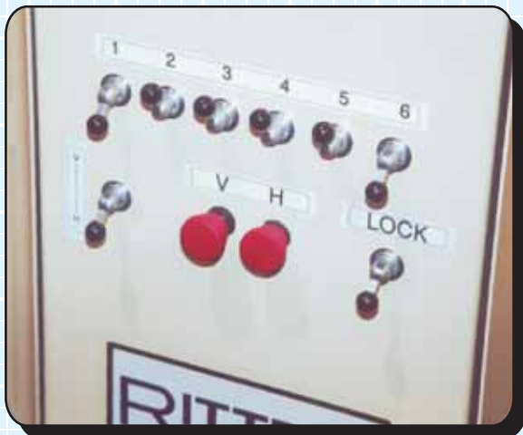
Control Panel for easy access to head, motor and stop controls