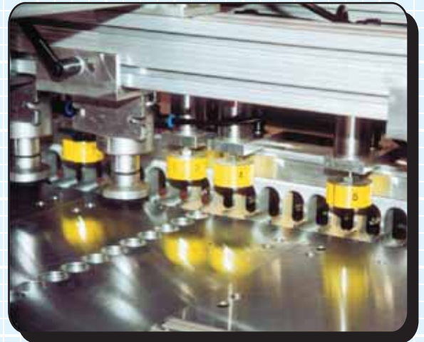
Pneumatic Stops are easily adjustable along the length of the fence