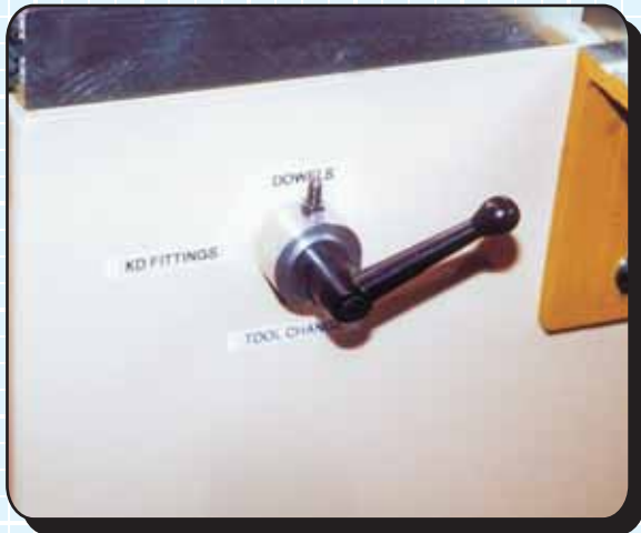
Vertical Head Depth Control Turret